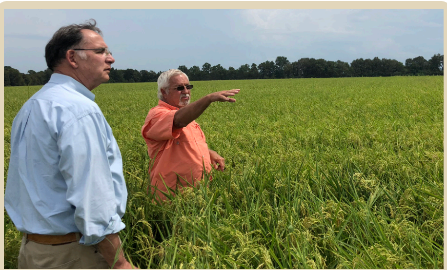
Senator Boozman is a champion for agriculture. As the top Republican on the Senate Agriculture Committee, he is leading efforts to create policies that ensure farmers and ranchers can continue providing the safest, most abundant and most affordable food supply in the world.

input on an incredibly wide range of subjects. So, the reality is my committee work all fits together in such a way that we get to make very important progress on the issues that I'm heavily invested in and knowledgeable about in order to deliver for the people of Arkansas and folks across the country.