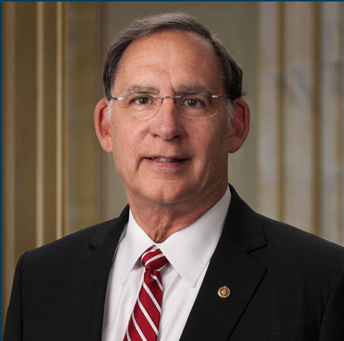
Senator John Boozman

In this issue of Capitol Currents, we profile another elected official who has championed the inland waterways: Senator John Boozman (R-AR)