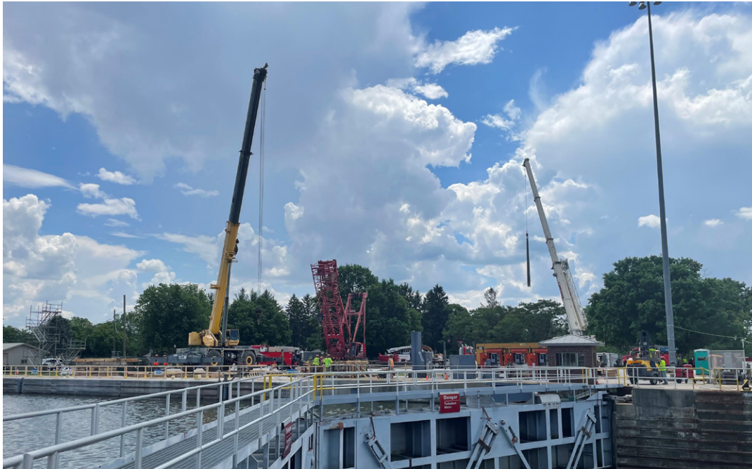
Dresden Island Lock was re-watered on September 10th after both upstream and downstream pre-cast valve installation was done, and miter gate anchorages and pintles were set.

The Illinois Waterway, with its eight lock and dam sites long overdue for significant repairs, was closed 120 days for major maintenance that began June 1 and concluded with its reopening on September 30.