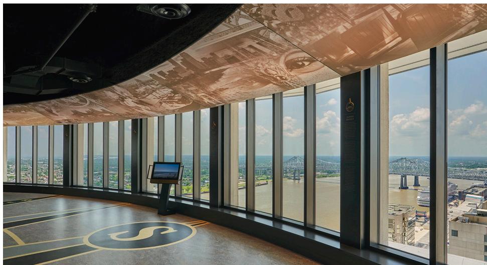
WCI will hold its opening reception on November 13 at Vue Orleans, atop the Four Seasons, which offers “panoramic views of the city and tech-forward presentations of the city’s history and culture.”