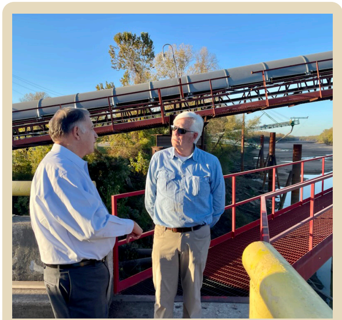
Senator Boozman advocates for investments in America's waterways to support the safe and efficient transportation of agriculture exports.

A: Each committee has different areas of focus and very important responsibilities that we take great pride in contributing to and being active in. The Farm Bill is currently up for reauthorization, so as the top Republican on the Senate Ag Committee, that's obviously a major priority right now. The EPW Committee deals a lot with the infrastructure that underpins our economy and helps sustain communities, while the VA Committee works in a very bipartisan way to make sure our country fulfills the promises we make to the men and women who serve in uniform. And the nice thing about the Appropriations Committee is that it deals with funding all federal programs and agencies, so we get to have