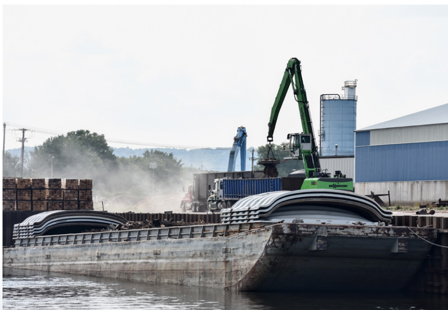
A crane loads scrap metal into a barge at F.J. Robers Company Terminal in the Black River portion of La Crosse Harbor.

For more information about UMRBA, visit www.umrba.org .