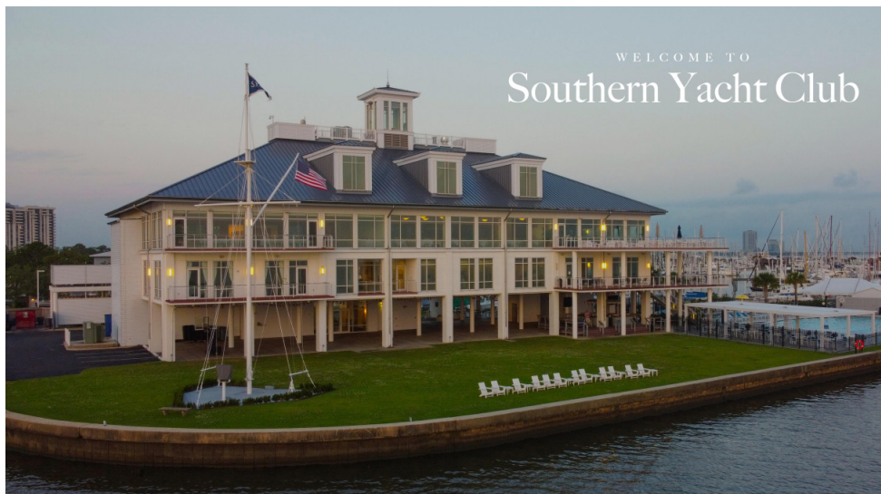
The Southern Yacht Club, which traces its history back to the club's founding in the Gulf Coast resort town of Pass Christian, MS, in 1849, is known as the second oldest yacht club in the United States and is the site of WCI’s special event on the evening of November 14.