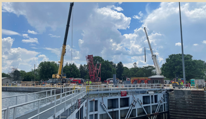
Even before the full ILWW Closure, construction had begun at Dresden Island Lock, with control stand and valve work underway.

After years of planning, closures on the Illinois Waterway (ILWW) at Marseilles, Dresden Island, and Brandon Road Locks have begun, as crews are moving floating plants, removing gates, setting bulkheads, and preparing to dewater the lock chambers. The closure is expected to last up to four months, through September 30.