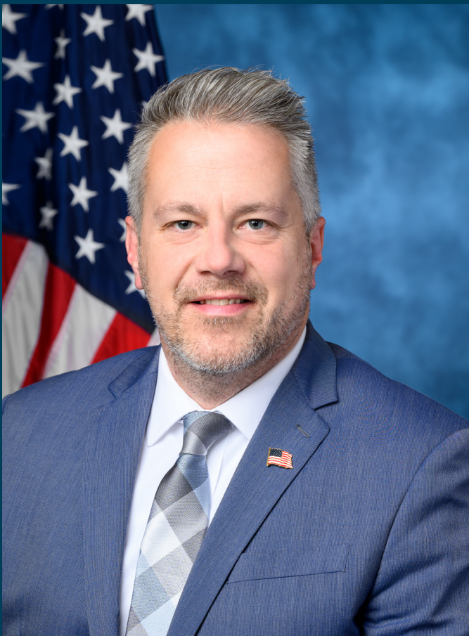
Congressman Eric Sorensen

In this issue of Capitol Currents, we profile another elected official who has championed the inland waterways: Rep. Eric Sorensen (D-IL)