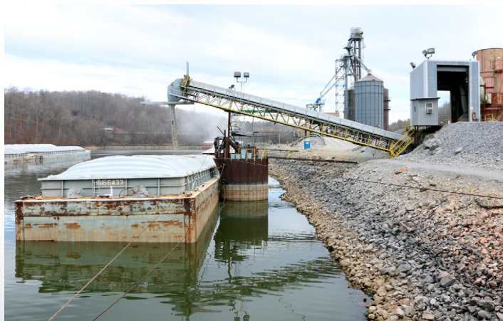
Eddyville Kentucky Riverport

BFW has a long history of delivering quality projects for diversified clients in waterways, educational, transportation, commercial, industrial, and municipality markets. The secret sauce—their people centered approach. BFW was founded on the principles of relationships, where quality engineering designs are delivered, tailored around each and every client they serve.❖