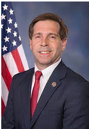
Rep. Chuck Fleischmann

2023 has started with a series of speed bumps for Congress and the Administration. First, there was the five-day, 15-ballot floor fight to elect Speaker McCarthy, which was the first time since 1923 that a Speaker was not elected on the first ballot; next came the debt ceiling, which pretty much paused all advancement of legislation until a deal was reached, and lastly we are seeing the effects from the debt-ceiling fight in Congress with the first rule vote failing in the House of Representatives since 2002.