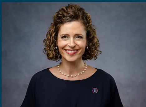
Rep. Julia Letlow

In this issue of Capitol Currents we profile another elected official who has championed inland waterways: Congresswoman Julia Letlow of Louisiana’s Fifth District.