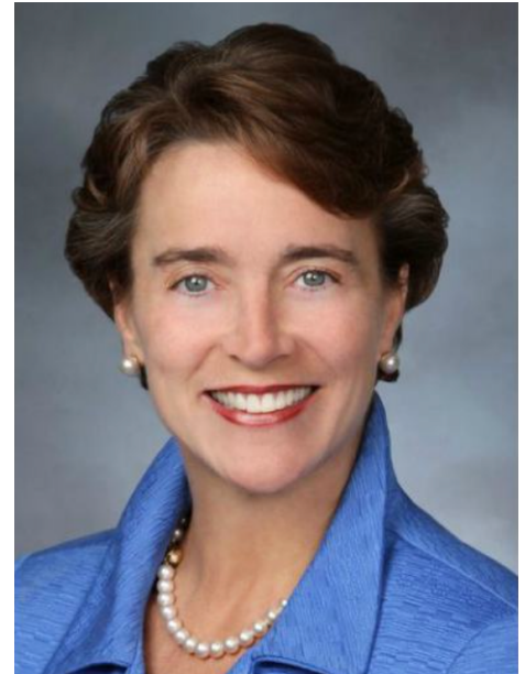
Former Senator Blanche Lincoln

Of course, when it comes to other key actions in Congress, the Water Resources Development Act (WRDA)