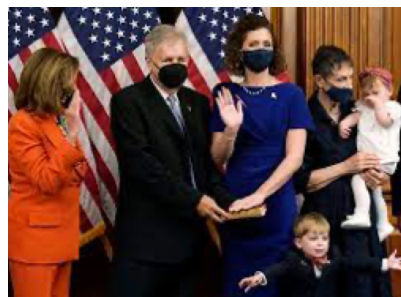
Letlow was sworn into office in April 2021.

I’m incredibly proud of the fact that my district has the longest continuous stretch of the Mississippi River in the nation. It’s the superhighway that connects our region to the world, bringing in needed materials and helping us transport the soybeans, rice, cotton, corn, grain sorghum, sweet potatoes, and sugar we grow to market. Any shutdown on the river is a significant hit to our economy. I’m constantly talking with our ports and the Corps of Engineers