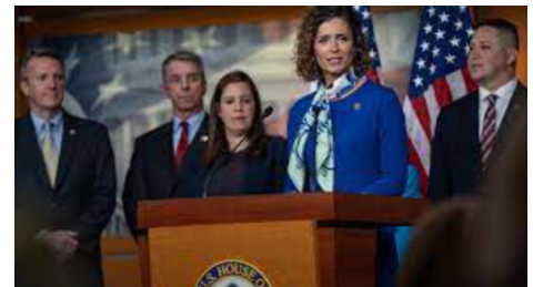
Rep. Letlow was named to the powerful House Appropriations Committee in her first term in office.

John Mayer – his music is the soundtrack of my high school and college days!❖