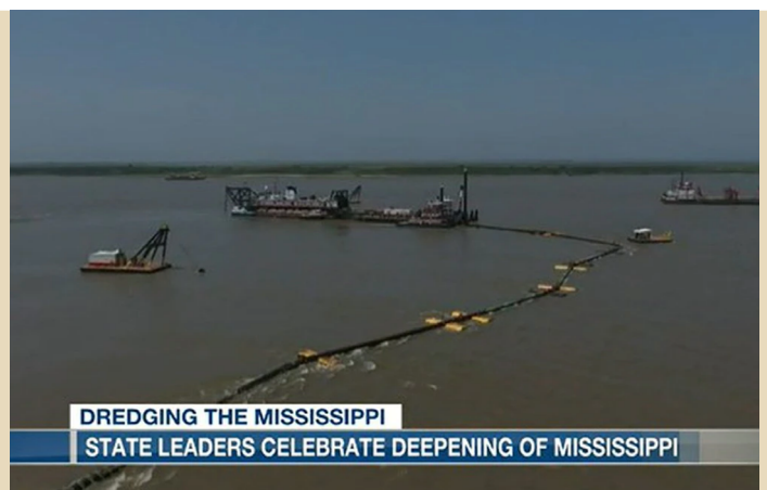
DREDGING THE MISSISSIPPI STATE LEADERS CELEBRATE DEEPENING OF MISSISSIPPI

On August 16, Louisiana state and local leaders met to commemorate the completion of the first of two phases of a $250 million project to deepen to a maximum draft of 50 feet the Mississippi River to allow Panamax-size vessels to navigate to the state’s ports. WCI member The Big River Coalition hosted the event and has worked tirelessly for a decade with state and local leaders, the Army Corps of Engineers and other agencies on efforts to deepen the river.