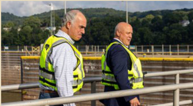
On August 23, Pennsylvania Senator Bob Casey (left) welcomed Mitch Landrieu (right), White House Senior Advisor & Infrastructure Implementation Coordinator, to Beaver County, Pennsylvania to see construction progress on the Montgomery Lock and Dam. Funding from the Infrastructure Investment Jobs Act “will help engineers complete significant improvements to this key part of the region's economy,” Senator Casey said.