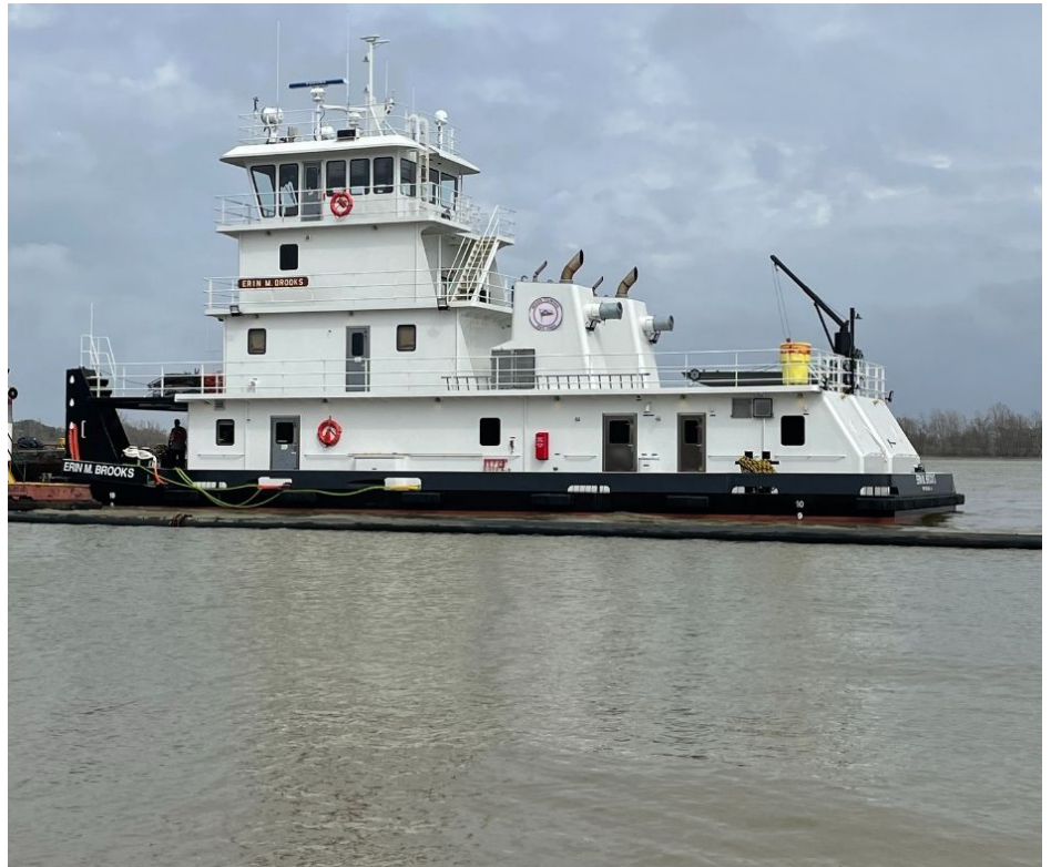
The M/V Erin Brooks is one of Woods Resources’ resources.

This move of vertical integration ends their reliance on outside horsepower and allows the company to barge in more material than they were previously, which comes in good time as the demand for foundation material surges.