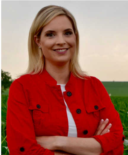
Congresswoman Hinson served as a freshman member of the House Appropriations Committee, and joined with Rep. Cheri Bustos (D-IL) to advocate for earmark and infrastructure funding for the NESP program.

Q: What prompted you to get into public service, and what has been the exciting aspect of representing your district?