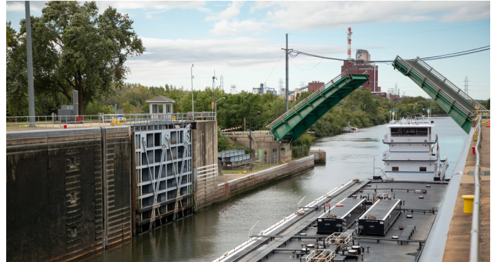
A tow enters the lock chamber from downstream at Brandon Road Lock and Dam in Joliet, Illinois.

During the closures, no vessels will be able to pass through the lock. Navigation in the pools upstream and downstream of the lock chamber will not be impacted as water levels will be maintained at a normal level throughout the season. To contact the lock at any time during the closures, call 815/744-1714 or use marine radio channel 14.