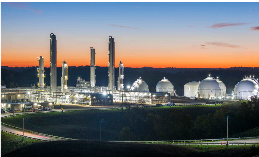
MarkWest Energy -- now a subsidiary of Marathon Petroleum -- Hopedale Fractionation Facility.

Efficient, robust, and additional infrastructure is key to bolstering Harrison County's growth, and this includes the inland waterways that surround the area. The Ohio River and other tributaries offer transportation options for moving raw materials in and finished products out of the region. All of the plants and other infrastructure that has come with this new growth have come up the Ohio River and off loaded to be trucked to our county. "WCI was a natural choice for Harrison County because we see the bigger picture on transportation that includes all modes operating as efficiently as possible," he said. "In today's business environment, the nation, regions, states, cities and counties must be aware of the challenges affecting modal infrastructure and be prepared to support policies that will strengthen and modernize them for decades to come," he added. "We must continue to advocate for additional investments in our waterways as well as roadways, rail, and infrastructure as a whole. The best way to accomplish this is by having a seat at the "table" to have those hard line discussions and make others aware of the growth we are experiencing, and the needs we have to help continue this growth, WCI is the leader/advocate to those table discussions." ♦