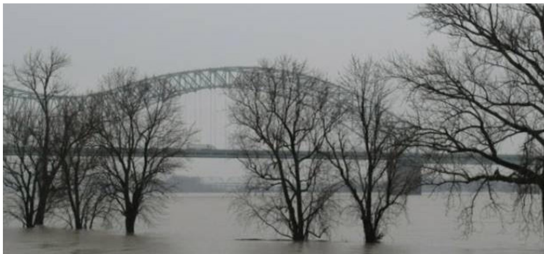
Ohio River Floods: A low-lying park sits flooded by the swollen Mississippi River on Friday, Feb. 22, 2019 in Memphis, Tennessee. Located on Memphis’ Mud Island, Greenbelt Park (pictured) floods when the Mississippi River reaches high levels.