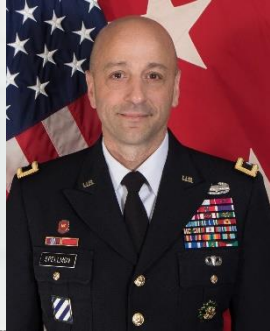
Deputy Commanding General, Civil and Emergency Operations