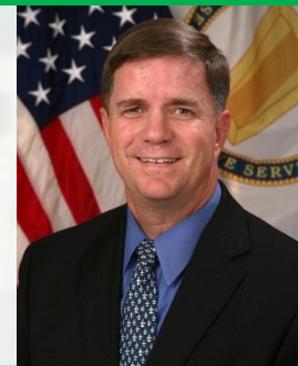
Interim Director of Civil Works