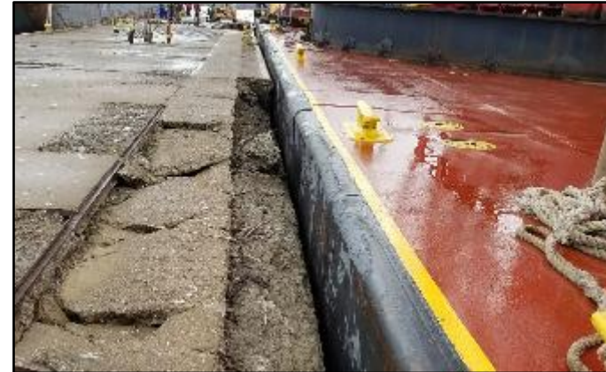
20' failed section of the lock chamber wall (13 APR 2018)