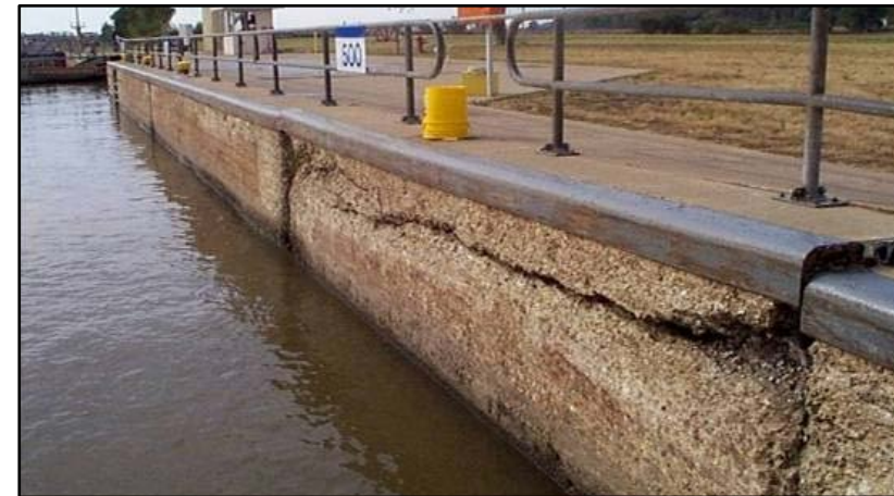
Unsafe conditions for both lock workers and the Navigation Industry